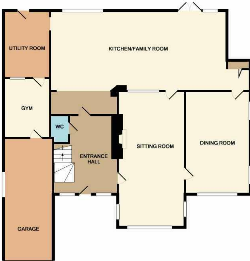
GROUND FLOOR APPROX. FLOOR AREA 1403 SQ.FT. (130.3 SQ.M.)