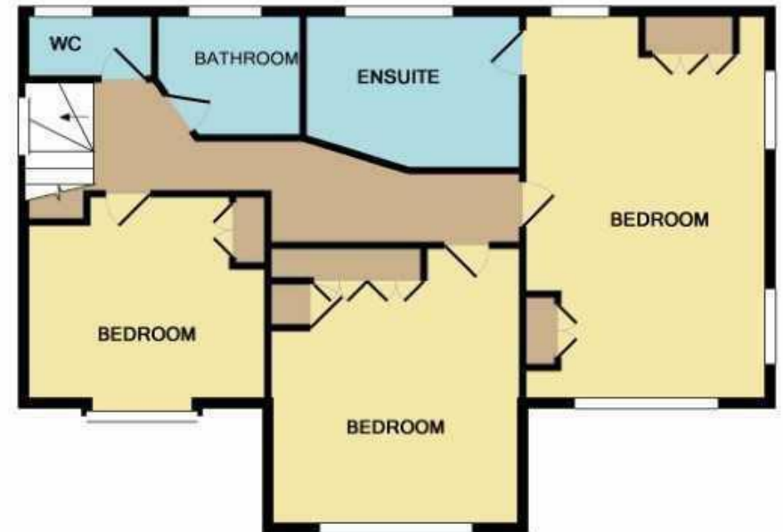
1ST FLOOR APPROX. FLOOR AREA 647 SQ.FT. (60.1 SQ.M.)

TOTAL APPROX. FLOOR AREA 2050 SQ.FT. (190.4 SQ.M.)